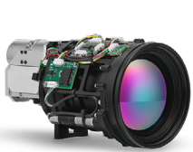
Neutrino LC CZ 15-300