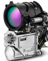
Neutrino LC CZF 25-250