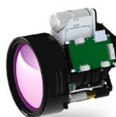
Neutrino LC CZF 30-600