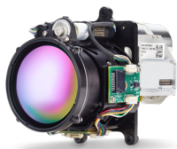
Neutrino LC CZ 19-290