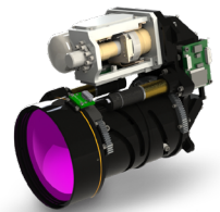
Neutrino LC CZF 25-375