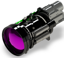
Neutrino LC - ISR 20-420