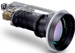
Neutrino SX12 - ISR 1200