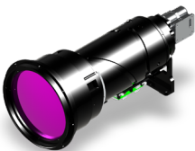
Neutrino SX8 - ISR 35-700