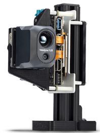
Prism Development Kit for Qualcomm RB5

SANTA BARBARA Teledyne FLIR LLC, Inc. 6769 Hollister Ave. Goleta, CA 93117 PH: +1 805.690.6602