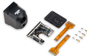
Qualcomm Snapdragon 865